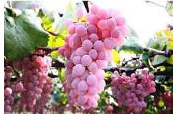
Grapevine July 24, 2022